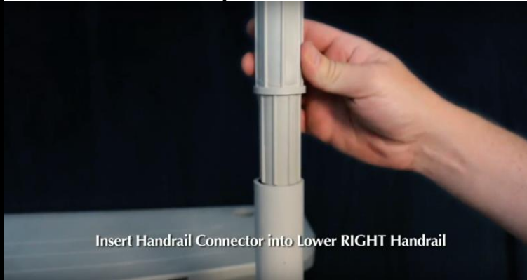
Insert Handrail Connector into Lower RIGHT Handrail

Step 3: Insert the smaller end of the handrail connector into the top of the lower handrail.