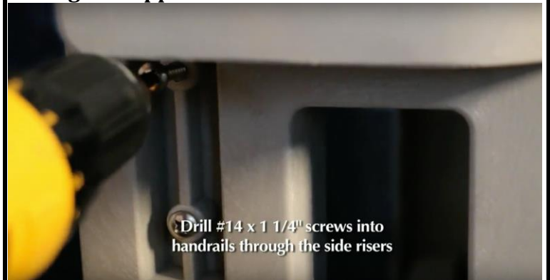
Drill #14 x 1 1/4" screws into handrails through the side risers

Step 6: Drill #14 x 1 1/4" screws into handrails through all upper and lower risers.