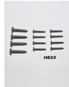
Aluminum Upper Handrail, Deck Connector, Handrail Connector, Hardware Kit

Step 1: Start by removing the plastic upper handrail from your existing step.