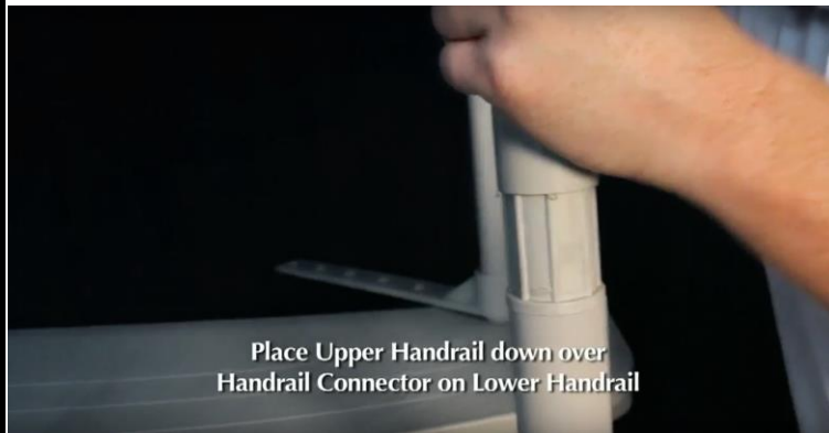
Place Upper Handrail down over Handrail Connector on Lower Handrail

Step 5: Place upper handrail down over the handrail connector.